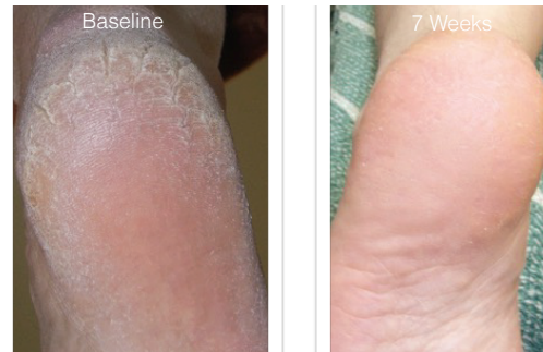
Four (4) SilkPeel Dermalinfusion Treatments Over 7 Weeks Pore Clarifying and Ultra-Hydrating Pro-Infusion Serums