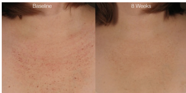
Five (5) SilkPeel Dermalinfusion Treatments Once Every 2 Weeks Skin Brightening Pro-Infusion Serum