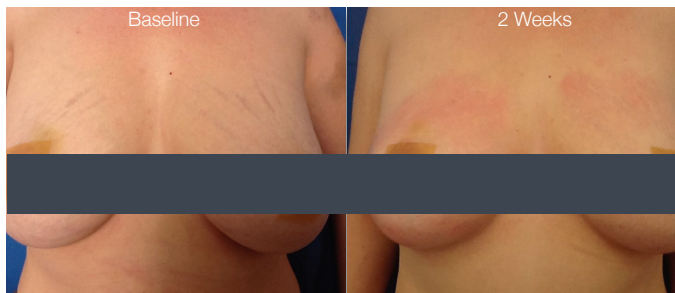
Three (3) SilkPeel® Dermalinfusion Treatments Once Every Week Pore-Clarifying and Skin Brightening Pro-Infusion Serums